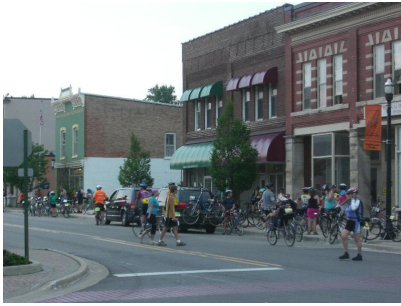
700 Riders spending time in Leslie

Eligible Senior Citizens can defer their summer taxes. A deferment form is available at City Offices or on the City of Leslie's website by visiting http://www.cityofleslie.org/forms.shtm .