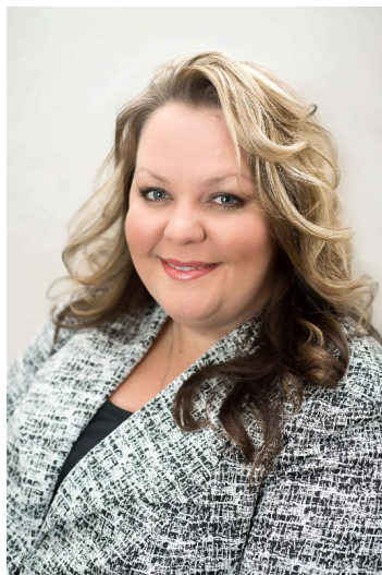
Mayor Jennifer Shuster

"In accordance with Federal law and U.S. Department of Agriculture policy, this institution is prohibited from discriminating on the basis of race, color, national origin, age, disability, religion, sex, familial status, sexual orientation, and reprisal. (Not all prohibited bases apply to all